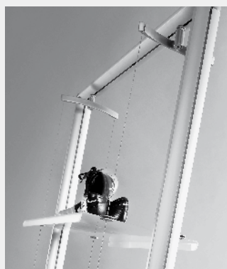
complemento d'arredo shop-und officeeinrichtung shop fitting & interiors