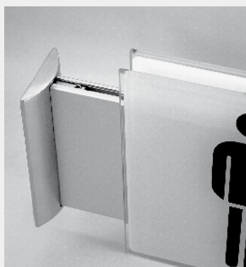
targhe & fissaggi befestigungen & schilder signs & fixings