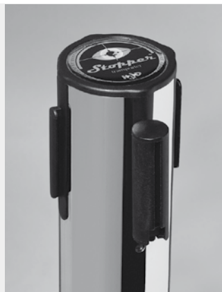
sistemi guidalinee personenleitsysteme crowd control