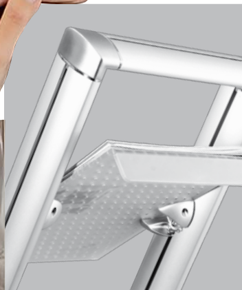
presentazione & portadepliant präsentation & prospektständer presentation & brochure holders