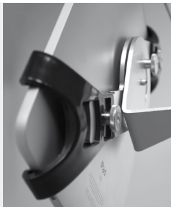
sistemi espositivi displays & werbeträger digital print displays